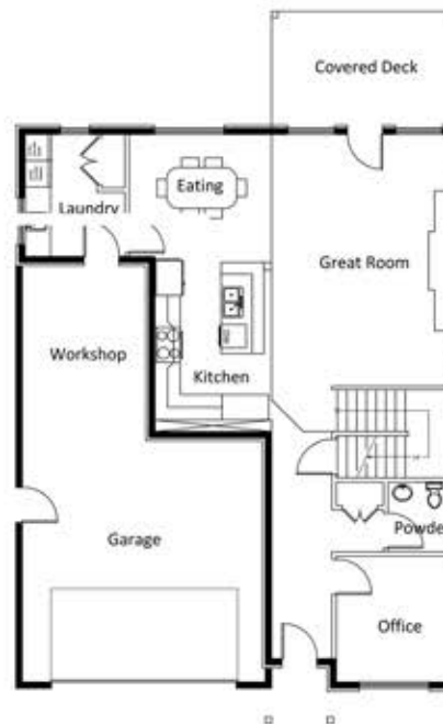
Main Floor: 1,177 sq. ft.