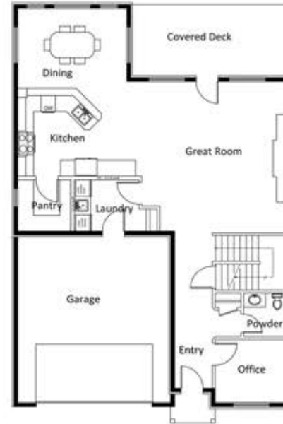
Main Floor: 1,356 sq. ft.