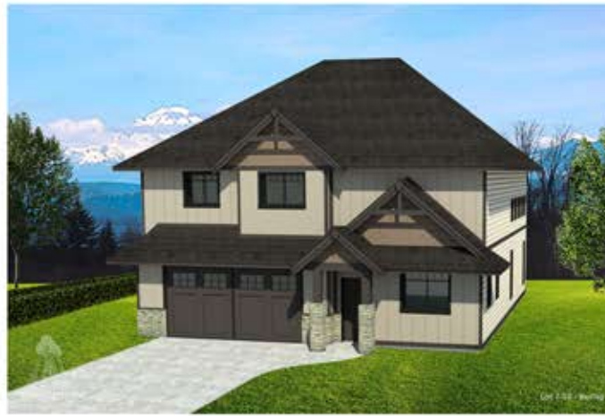
Single Dormer View