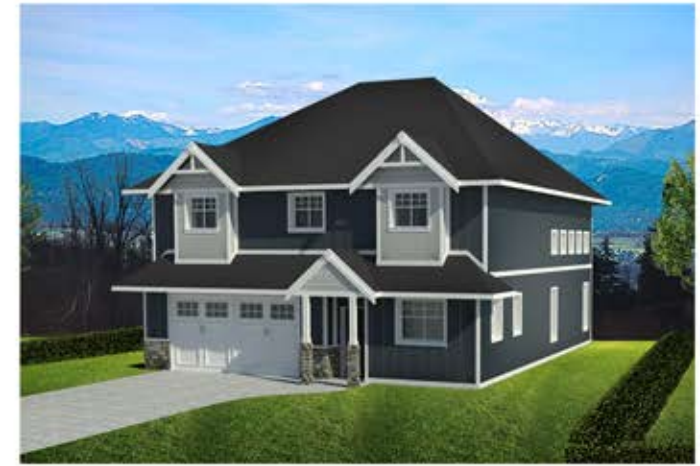
Double Dormer View